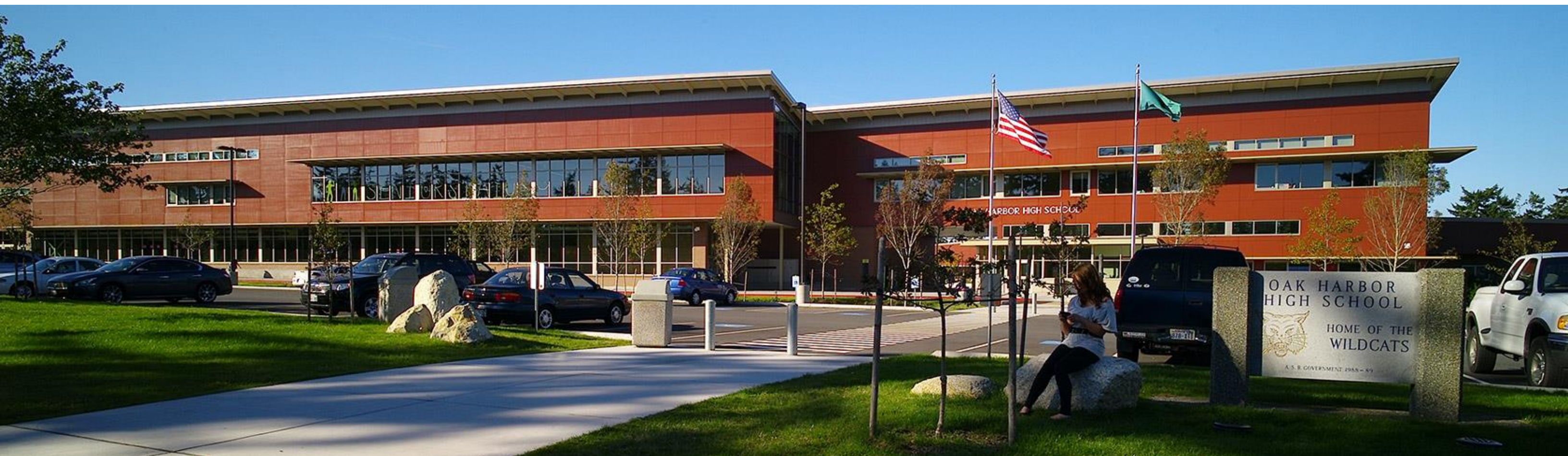
Oak Harbor High School – NAC Inc.