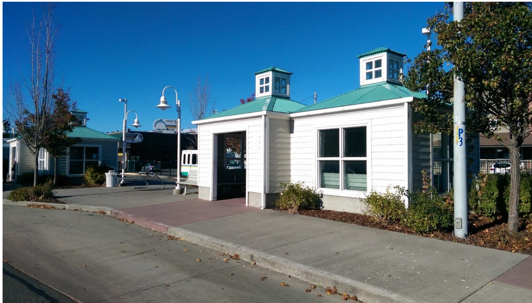
Oak Harbor Transit Station on Bayshore Drive