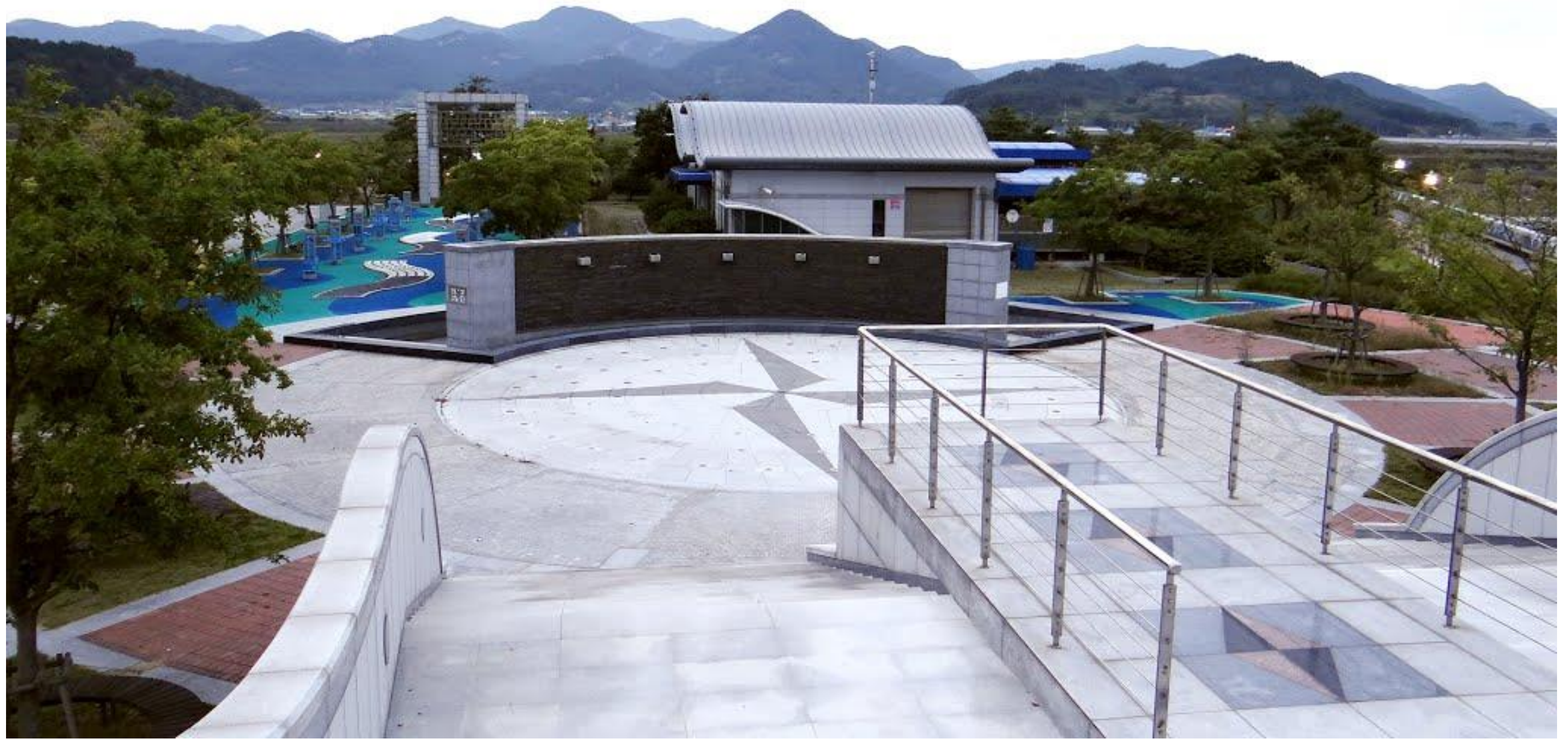
Wastewater Treatment Facility – South Korea