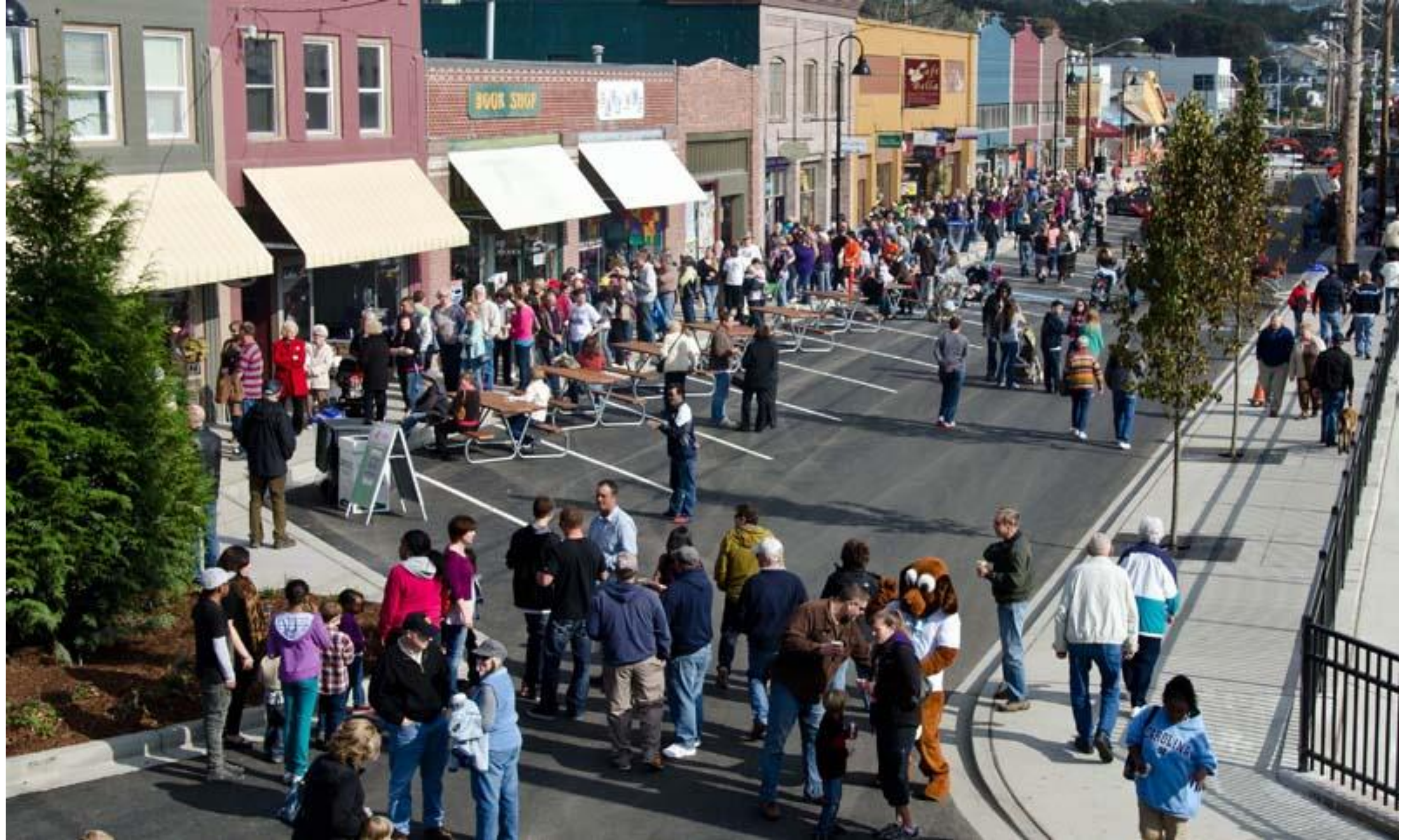
Downtown Oak Harbor