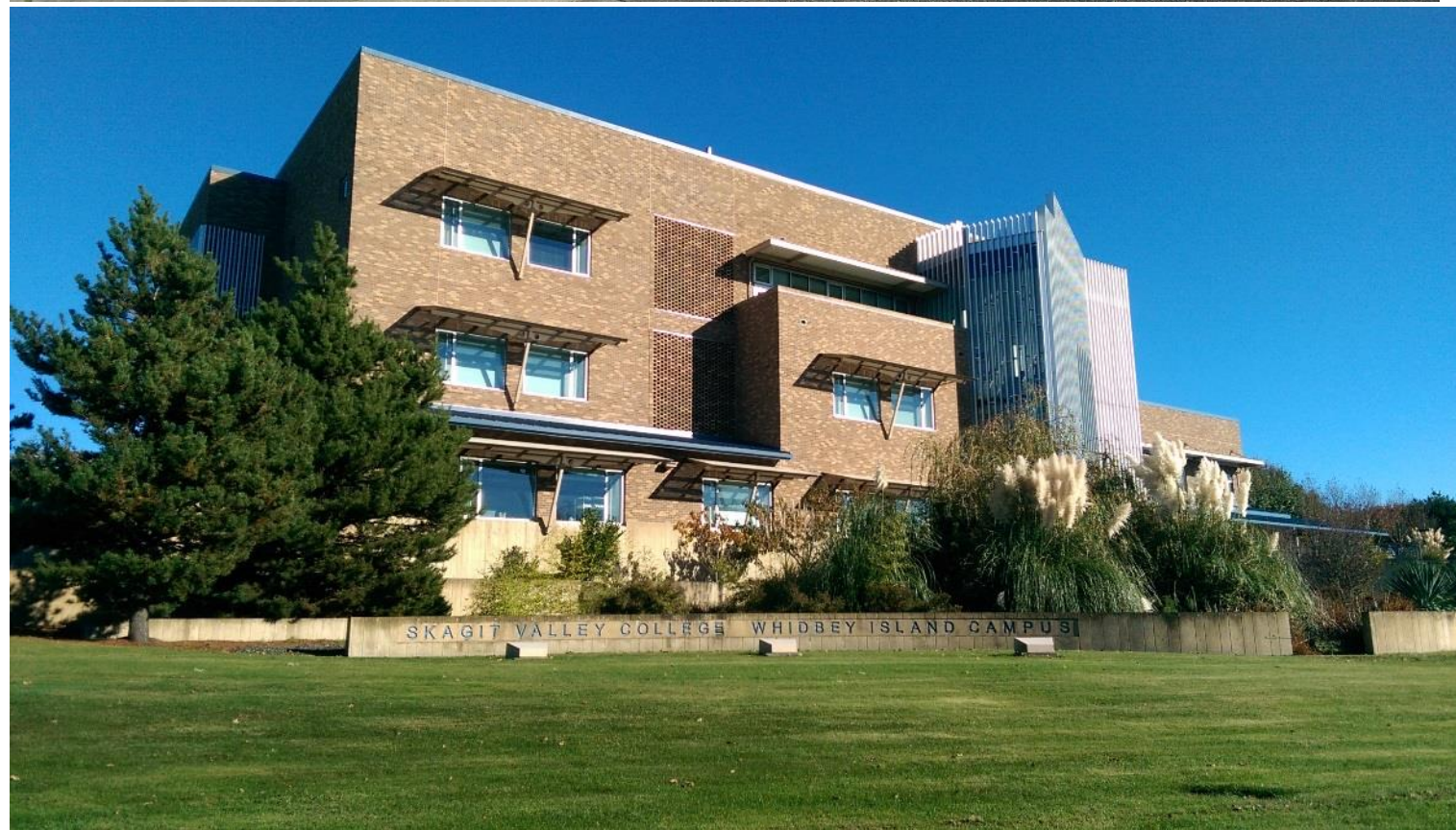
Skagit Valley College Whidbey Island Campus