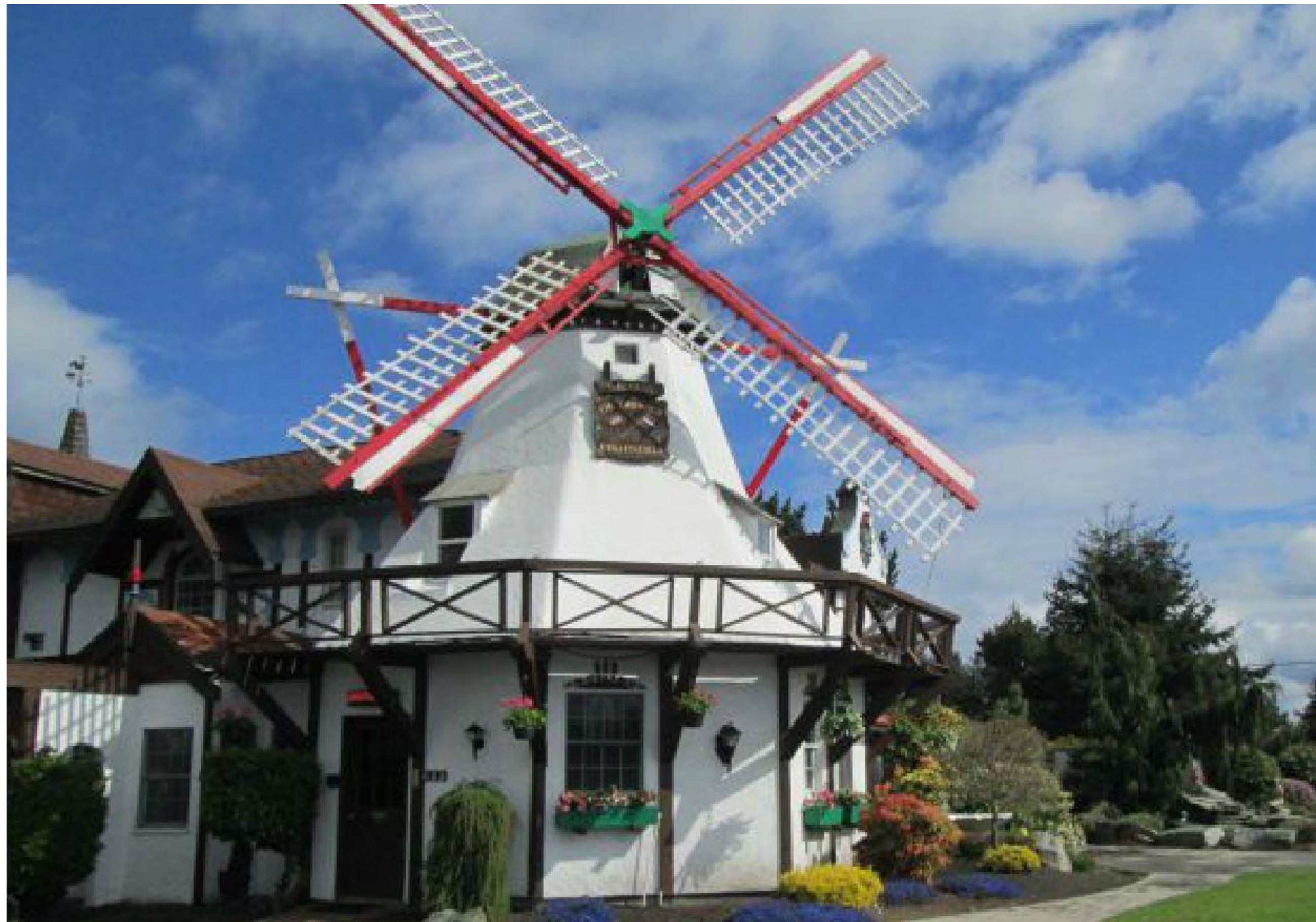
Auld Holland Inn Motel on Highway 20