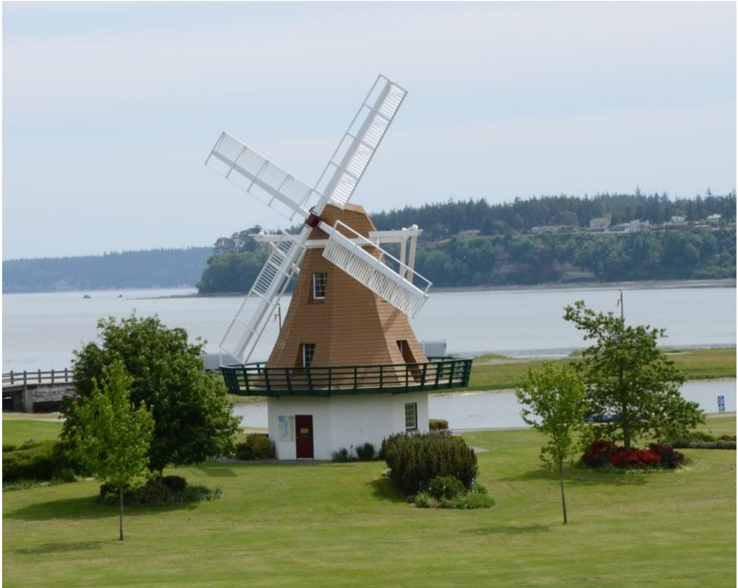
Oak Harbor Beach Park Windmill – Photo by MWA Architects