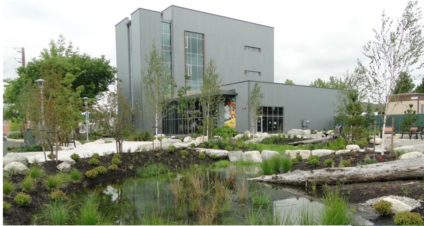
LOTT Treatment Plant (Olympia, WA)