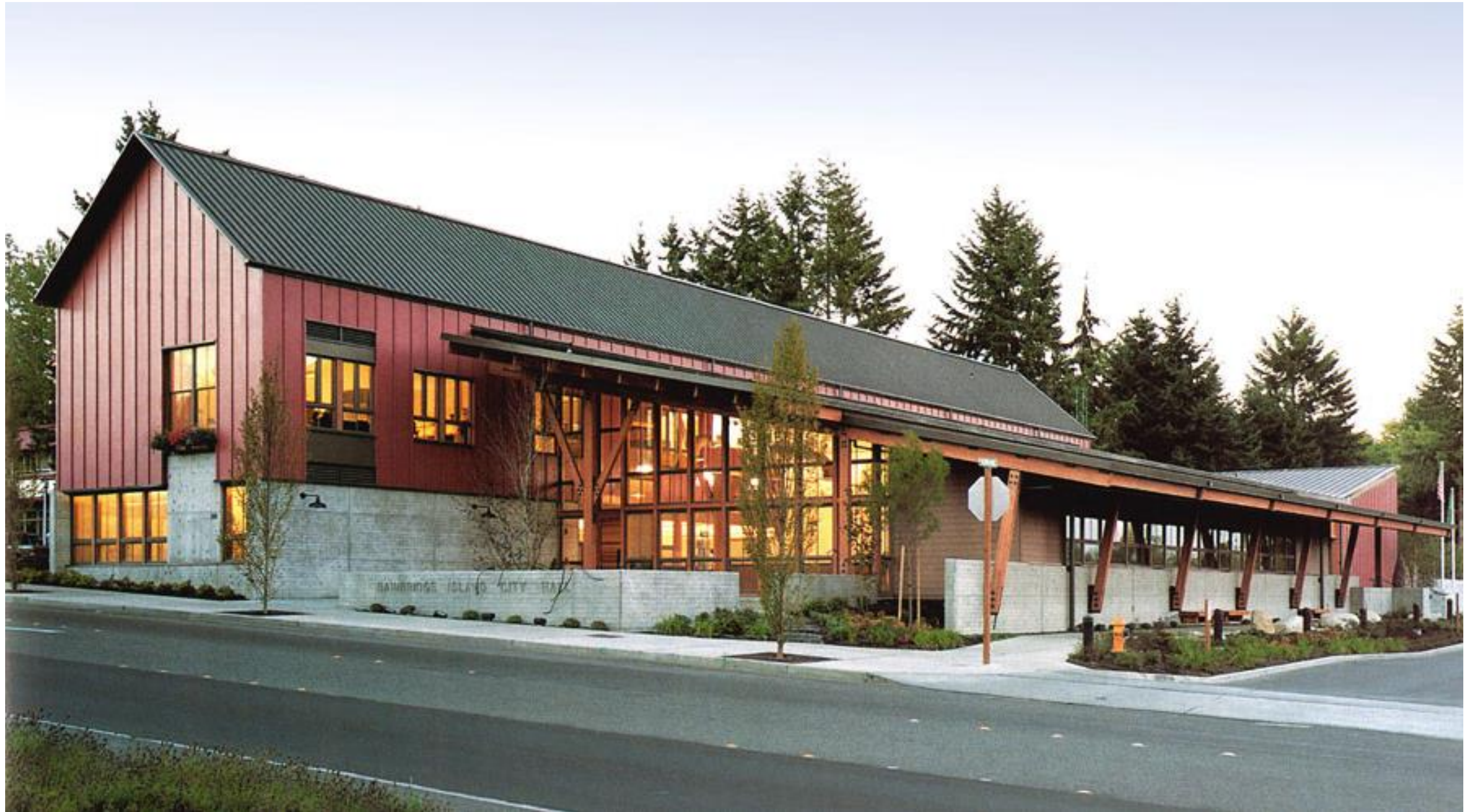
Bainbridge City Hall - MillerHull