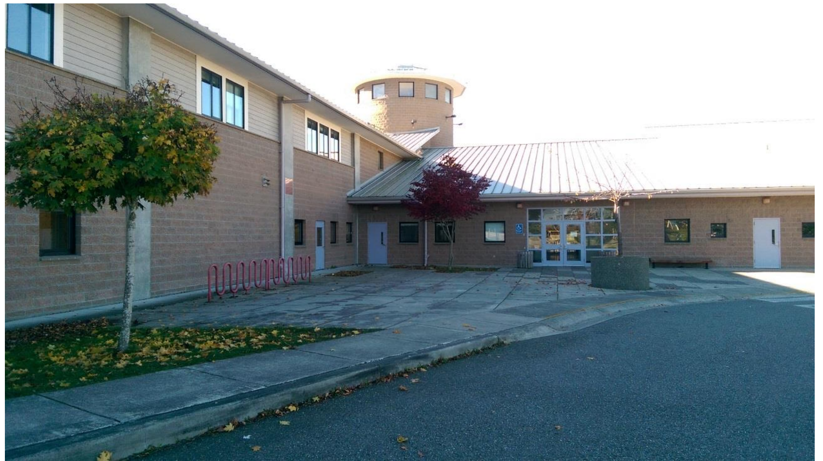
North Whidbey Middle School