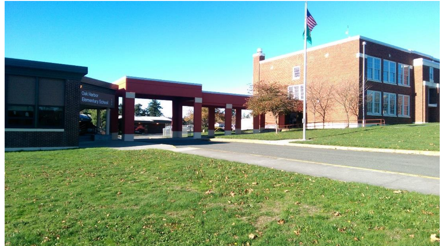
Oak Harbor Elementary School