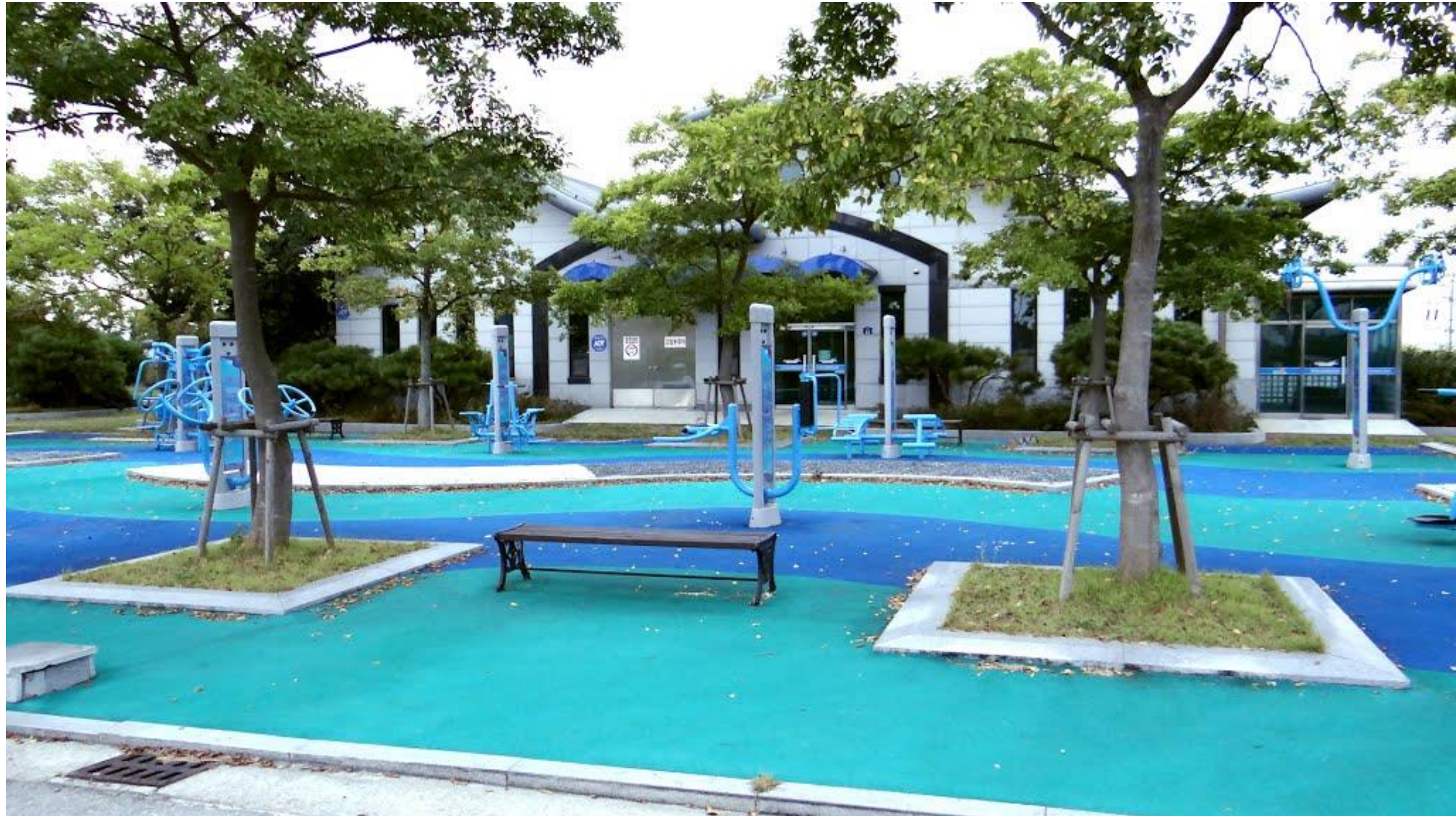
Wastewater Treatment Facility – South Korea