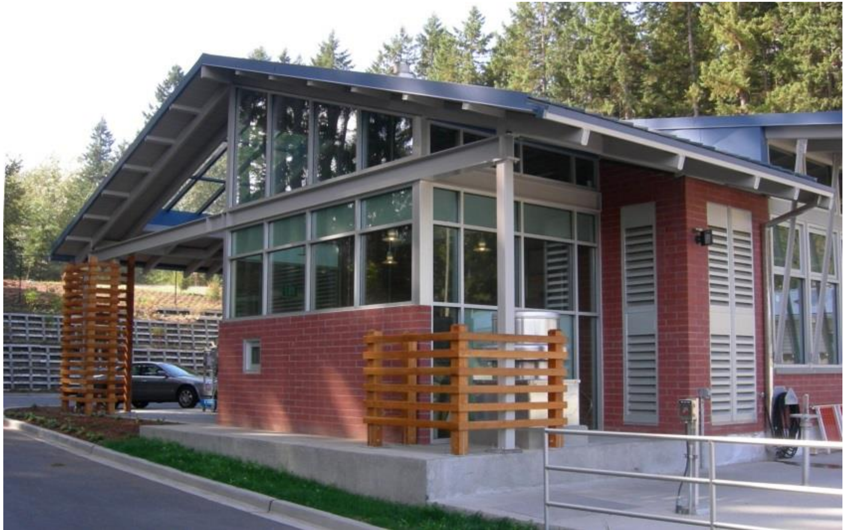
Hawks Prairie - MWA