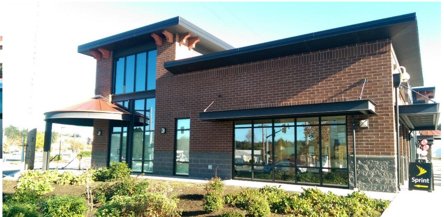
Harbor Station on 7 th Ave and Highway 20