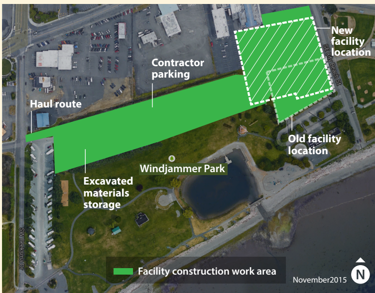
Clean Water Facility construction map

This project has been funded wholly or in part by the United States Environmental Protection Agency under an assistance agreement to the Washington State Department of Ecology. The contents of this document do not necessarily reflect the views and policies of the Environmental Protection Agency, nor does the mention of trade names or commercial products constitute endorsement or recommendation for use.