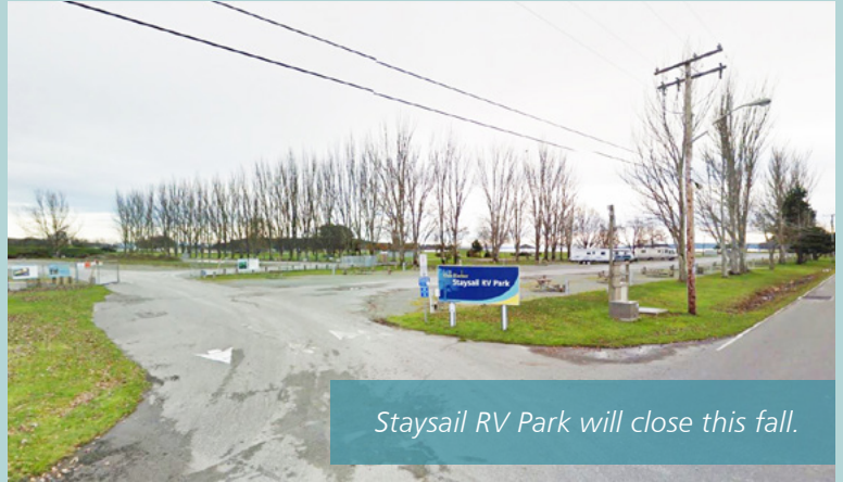
Staysail RV Park will close this fall.

Last year, the City of Oak Harbor worked with the community to create a plan for updating Windjammer Park in coordination with a Community Advisory Group. The City found that modernizing the RV Park would require the City to greatly reduce the number of RV stalls provided. City Council and the Community Advisory Group recommended removing the RV Park to make room for a gateway pavilion, restrooms, basketball courts, a large kitchen, and more.